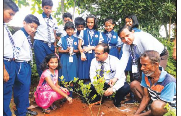
PLANT A TREE