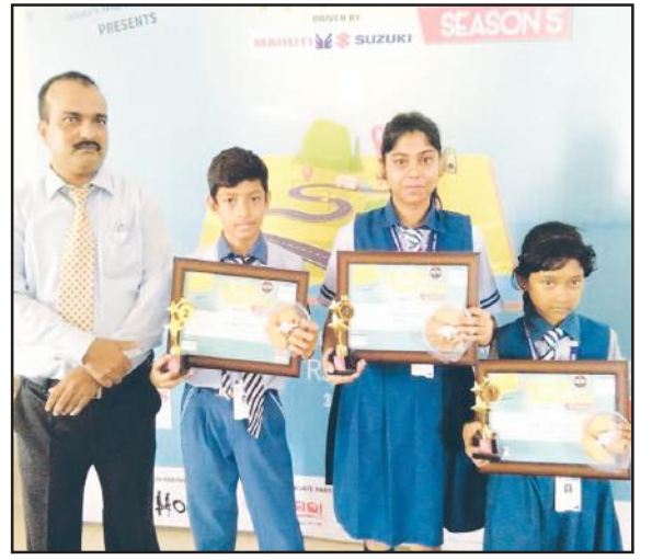
DRAWING COMPETION WINNER